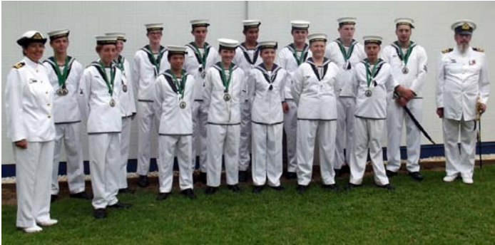
TS Centaur Staff and Cadets at the Annual Presentation Parade 2016.